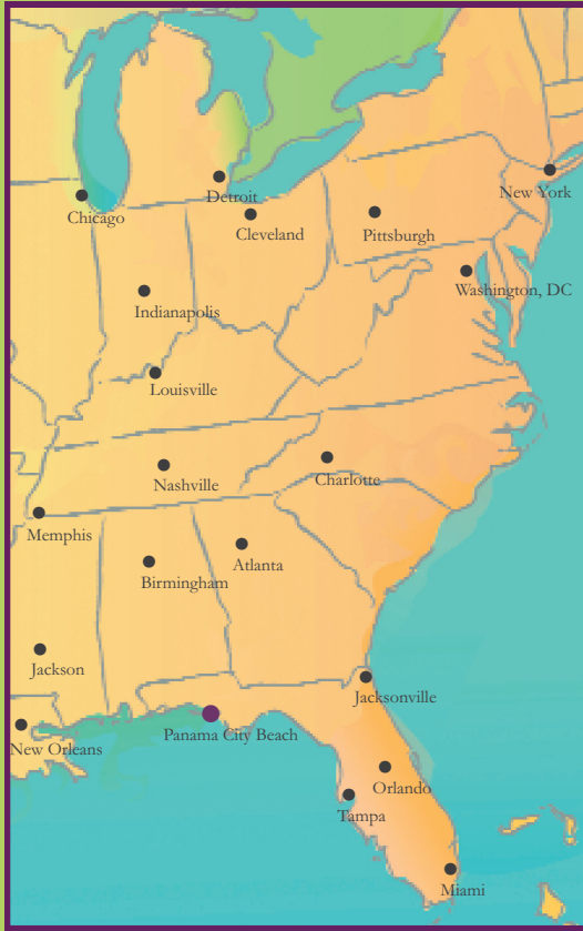
Panama City Beach, Florida is located within a 8 hour drive or 2 hour air flight on much of the eastern U.S.