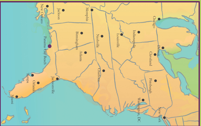
Panama City Beach, Florida is located within a 8 hour drive or 2 hour air flight on much of the eastern U.S.